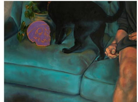
Work by Ashley Rabanal

Artifacts of Experience is an invitation to consider the tangible representations of personal histories and interior experiences. The exhibition pairs the work of four current