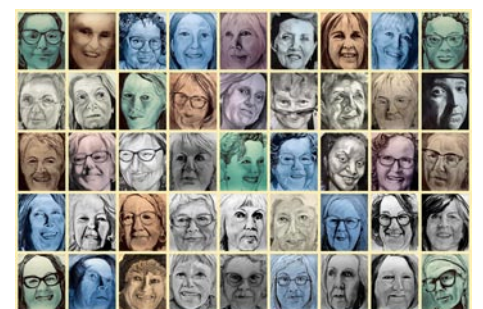
Work by Betti Pettinatti-Longinotti

Artworks Gallery , 564 N. Trade Street, Winston-Salem. Oct. 4 - 29 - "Celebrating Women Artists," featuring works by Betti Pettinatti-Longinotti. Receptions will be held on Oct. 6, from 7-9pm and on Oct. 22, from 1:30-3:30pm, with a gallery talk at 2pm. An Art Crush will be held on Oct. 20, from 7-9pm. "Celebrating Women Artists" presents 145 portraits, vitreous paintings on glass. This installation is a 'Gestalt' in that the sum of these women artists is greater than all their contributions combined. The installation of these portraits serves as an archive of women artists completed gradually over the last 12 years. It honors artists that are varied geographically and of local, regional, national, international, and historical reputation. Ongoing - The gallery is the longest running cooperative gallery established by artists for