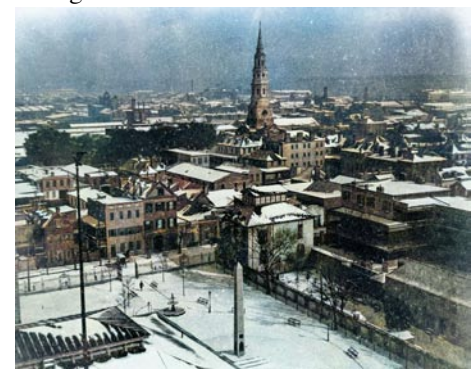
"Birds-eye view of Charleston rooftops overlooking Washington Square Park". Captured by Rober Achurch, February 1899. Courtesy of The

For years, photograph colorization was used mainly by high tech production companies. Recently however, computer programmers have created colorization operating systems that use Artificial Intelligence. Modeled after the human brain, the AI software can recognize objects in a photograph and determine their likely colors. Although, it can still be time consuming and rather tricky, colorizing a historical photograph is now more accessible to everyday users. Visitors are invited to enjoy this collection from the Museum's Archives through a new lens of colorization.