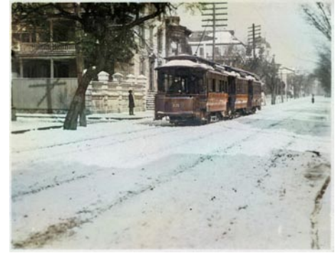
"Meeting Street trolley car making stops in the snow". Captured by Morton Brailsford Paine, February 1899. Courtesy of The Charleston Museum.

from the Museum Archives. Comprising over 40,000 photographs and representing a variety of themes, subjects and locations from around the Charleston area, this collection provides a glimpse into Lowcountry life from the dawn of the photography era to the present.