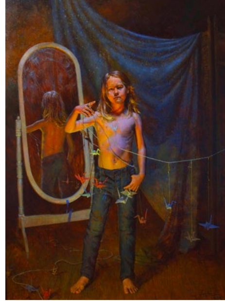
Work by Seth Haverkamp

Bella Vista Art Gallery, 14 Lodge St., Historic Biltmore Village, Asheville. Ongoing - Featuring works by regional and national artists in a variety of mediums. Offering contemporary oil paintings, blown glass, pottery, black & white photography, stoneware sculptures, and jewelry. Hours: Mon.-Sat., 10am-6pm & Sun., 10am-4pm. Contact: 828/768-0246 or at (www. Bella Vista Art.com).