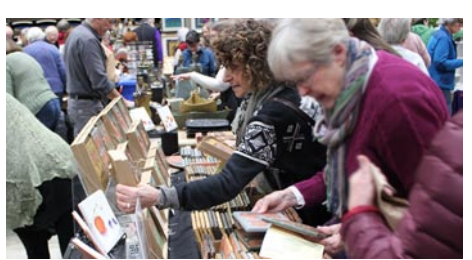
View from a previous show

This is the best opportunity to find deals on quality gifts during the holiday season and a chance to connect with the craftspeople in the region. For our makers, this is