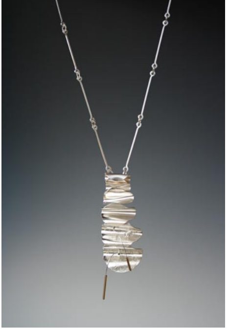
Work by Christie Calaycay

In Form in Motion , it is hoped that the art | pinkdog-creative.com).