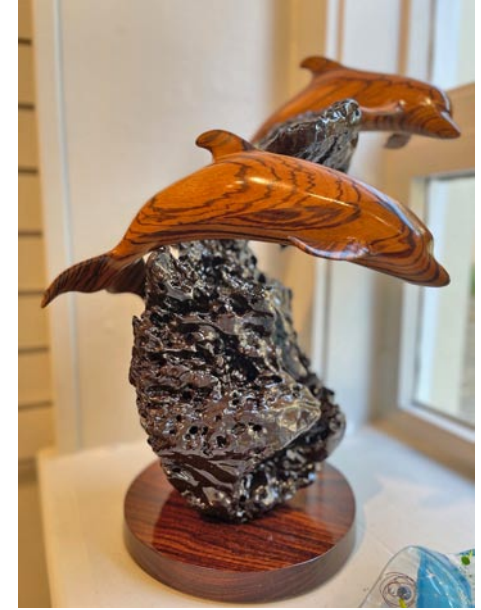
Work by Stephen Vadakin

Vadakin is a writer and wildlife artist who creates sculptures utilizing the mediums of wood and bronze. He works in native and exotic woods from all over the world. His sculptures are sanded to perfection and finished with the highest quality materials. Vadakin is also the founder of a marine science program for school children in the Midwest. To date, the program has reached more than 50,000 young people with an engaging message about the art of sculpture as it relates to oceans and marine life. Vadakin's collections have been featured at the Centre of Coastal Studies on Cape Cod, the South Carolina Maritime Museum, and Wyland's Galleries in Naples, FL, and Hilton Head Island, SC.