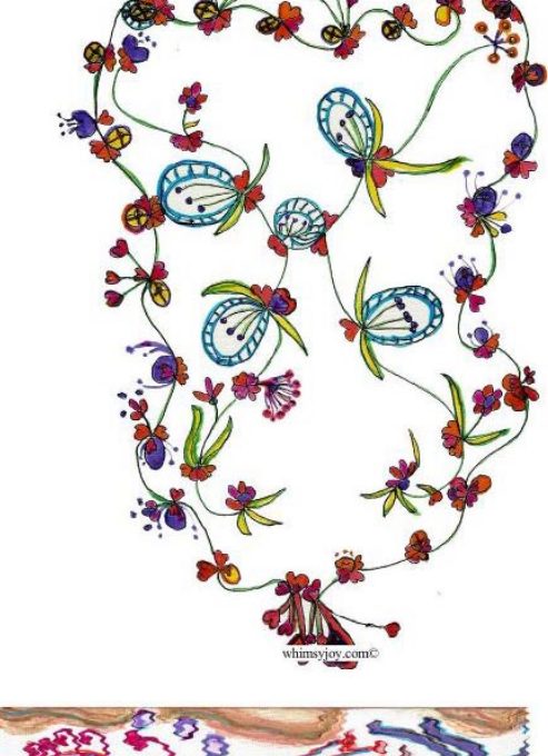
Floating Towards the Sun