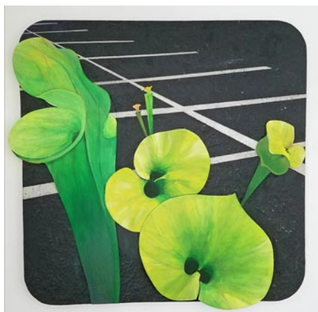
Work by Lisa D. Watson

In Avant Gardener: A Creative Exploration of Imperiled Species , she probes how loss of habitat, sprawl, chemical spraying, invasive exotic species, and poachers are