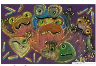
Family of Frogs

Prints · Notecards · Calendars Mousepads · T Shirts · Decals Aprons · Stickers Children's Paint Smocks