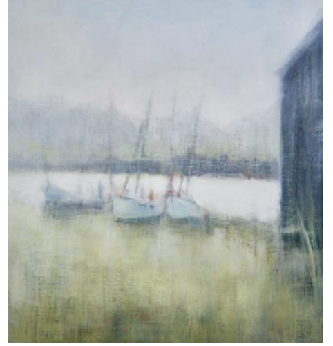
Work by Elizabeth Agresta

artists, but several of our locals originally came from countries around the world and have since settled in Charleston. These countries include Canada, England, Gercontinued on Page 4