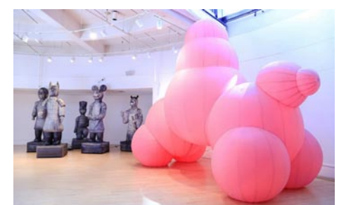
(Left), Lizabeth Rossof, "5 XI'AN AMERICAN WARRIORS", 2019, nylon fabric, dimensions vary. (Right), Sharon Engelstein, "Seeker", 2012, nylon fabric, forced air, 14 x 9.4 x 18. 6 feet.

From the outset, the artworks in BLOW UP II appear fun and playful; however,