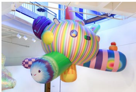
FriendsWithYou (Los Angeles, California), "Never Ending Story, Spider Man's Eye," 2019, ripstop nylon fabric, electric fan, 150 x 108 x 168 in.

Inflatables have a long history, dating as far back as the 18th century, and were initially perceived as innovative, if not magical, objects. Today, inflatables are often associated with happy memories. Lawn inflatables, bouncy houses, and party balloons are ubiquitous at holidays and celebrations. Water wings, inflatable inner tubes, and rafts conjure thrilling vacation memories. The awe-inspiring hot air balloon challenges our feet-on-the-ground perspective, allowing us to levitate and explore the land from above like a bird.