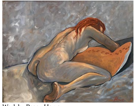
Work by Peggy Howe

Corrigan Gallery represents local artists with a few exceptions of visiting and second