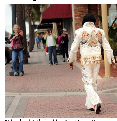
"Elvis has left the building" by Donna Rosser

Southern Icons, A to Z is a unique collection of contemporary images of curator-prescribed Southern icons by Southern photographers from several generations. After the photographs were created,