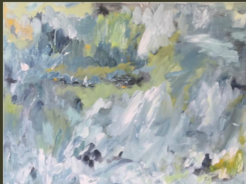
Coastal Series, Looking Back Through Memories , Acrylic on stretched canvas, 24 x 18 inches

Studio @ East Butler Rd, Mauldin, SC 29662 • MelindaHoffman.com • 864.320.0973