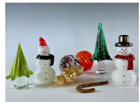
Works by STARworks Glass

STARworks is located at 100 Russell Drive in Star, just off I-73/74 in northern Montgomery County.