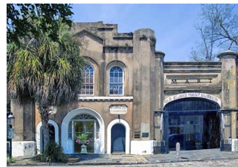
Old Slave Mart Museum

Purchase price for tickets is $35 for adults and $10 for children (ages 12 and under). Tickets can be purchased in advance via Charleston's Museum Mile website through Dec. 31, 2021, at (https:// www.charlestonsmuseummile.org/ticketpackages/) making these passes a great holiday gift. During the month of January tickets can only be purchased in person at the Kiawah Island, Mount Pleasant, North Charleston, or Downtown Visitor Centers. Explore and enjoy all that Charleston has to offer with Museum Mile Month and