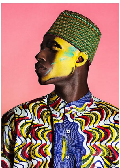
Namsa Leuba "Damien", 2015, 34 x 47.2 inches, Fiber pigment print Dibond NGL series, Nigeria

Our policy at Carolina Arts is to present a press release about an exhibit only once and then go on, but many major exhibits are on view for months. This is our effort to remind you of some of them.