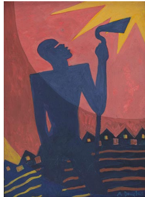
Work by Aaron Douglas