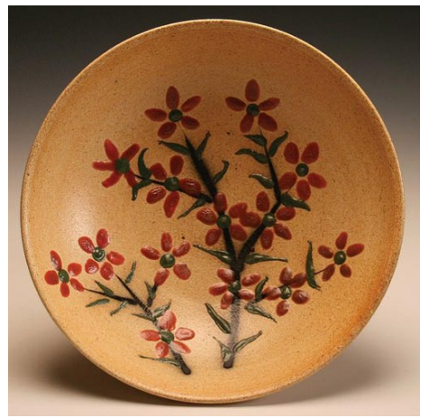
Work from Avery Pottery & Tileworks

yellow, rose pink, earthy brown, lime green and purple. Hours: Mon.-Sat., 10am-5pm. Contact: 336/879-3040 or at (www.anitaspottery.com).