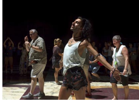
Elizabeth Bick, "Every God", 2019 40 x 50 inches, archival inkjet print

Bick's photographic practice includes a prolonged gaze in a specific place - a street corner, the Pantheon - where she can observe dramatic movement and light and shadow as they become a spectacle through her lens. Pedestrians are choreographed dancers and sidewalks are stages in Bick's rumination on the presentation of self.