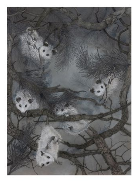
Work by Jean LeCluyse

The Hillsborough Gallery of Arts is owned and operated by 21 local artists and represents these established artists exhibiting contemporary fine art and fine craft. The gallery's offerings include watercolor, oil and acrylic paintings, metal and figurative