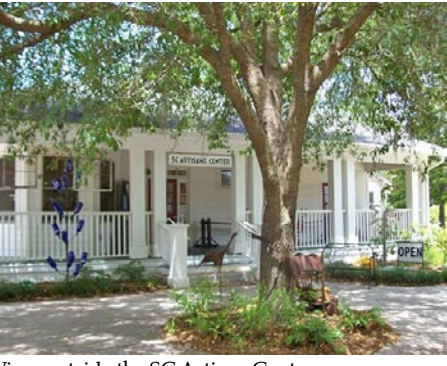
View outside the SC Artisan Center

SC Artisans Center, 334 Wichman Street, 2 miles off 195, exits 53 or 57, Walterboro. Ongoing - Featuring work of over 300 of the SC's leading artists. The Center offers educational and interpretive displays of Southern folklife. Its mission is to enhance the appreciation and understanding of the rich cultural heritage of South Carolina. Hours: Mon.-Sat., 9am-5pm. Contact: 843/549-0011 or at (http://www.scartisanscenter.com/).