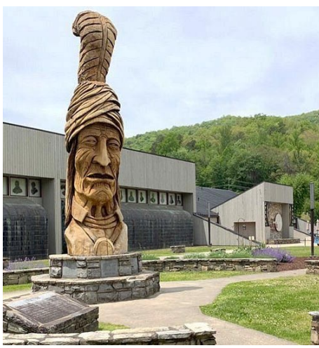
View outside The Museum of the Cherokee Indian

Qualla Arts and Crafts Mutual, 645 Tsali Blvd., across from the Museum of the Cherokee Indian, Cherokee. Ongoing - Featuring basket weaving, pottery, wood carving, finger weaving, beadwork, stone carving and fine painting by members of the Eastern Band of Cherokee Indians. Artisans must go through a juried process to become affiliated with the organization and current membership stands at about 300. Hours: open daily, year round, with seasonal hours. Contact: 828/497-3103 or at (www.cherokee-nc.com).