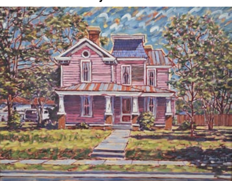
Work by Gene Davis

Cape Fear Studios, Inc., 148-1 Maxwell Street, Fayetteville. Main Gallery, Through Jan. 9 - "Annual Holiday Member Exhibit". We have been active for 32 years. Our mission is to involve, educate, and enrich Cumberland County and surrounding communities with the opportunity to create and freely view art. Ongoing – New Gallery exhibit every 4th Friday of the month. We are a nonprofit cooperative of 30 local artist (always looking for new members)