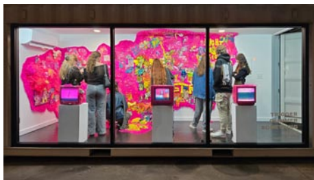
A view inside the Fried Fruit Art Gallery