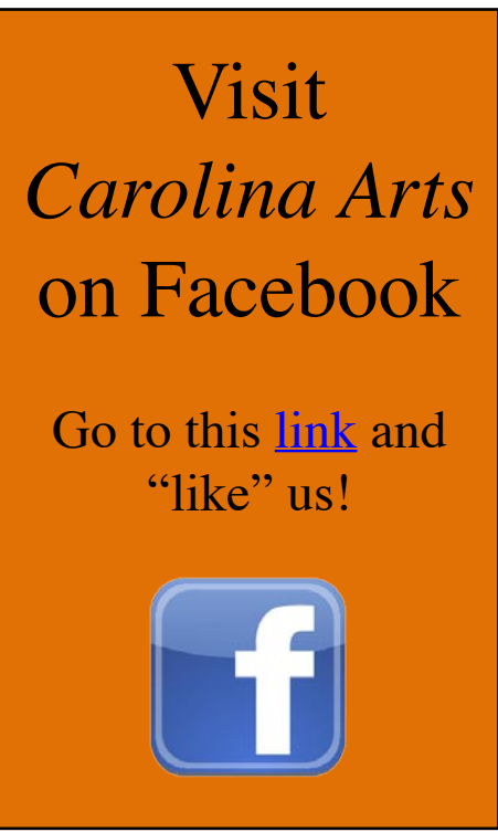
Carolina Arts, February 2019 - Page 15

To start in the next issue call 843/693-1306 or e-mail to (info@carolinaarts.com)