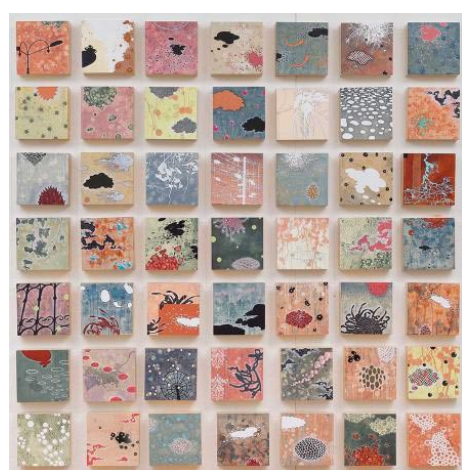
Tanja Softić, "49 Notes on Being There", 2016, acrylic, intaglio, photo collage, chiyogami paper, pencil, pen, and wiggle eyes, 8 x 8 in. each.

The Dillard Fund and xpedx have provided long-standing support for the Weatherspoon to acquire selections from each Art on Paper exhibition for The Dillard Collection of Art on Paper, which now numbers over 570 examples. The collection includes noteworthy and established artists