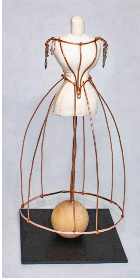
Work by Lynn Wartski

The Hillsborough Gallery of Arts is owned and operated by 22 local artists and represents these established artists exhibiting contemporary fine art and fine craft. The Gallery's offerings include oil and acrylic