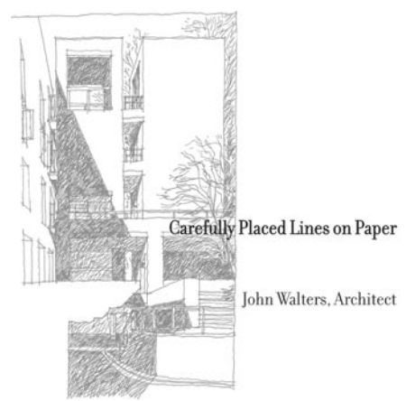
Book cover image: Kamphoefner Hall, North Carolina State University.

Carefully Placed Lines on Paper by Architect John Walters 230 pages ISBN 978-1-7923-5418-2 Library of Congress # 2020922001 Soft Cover, 8.5 x 8.5 inches $24.95 plus tax and shipping