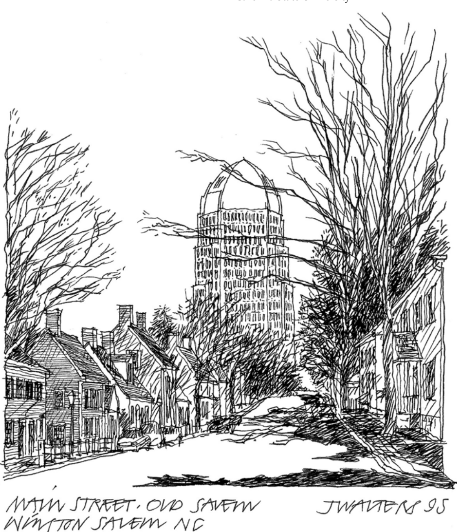
Plate #49 - Viewed from the campus of Salem College in Winston-Salem, NC, 100 North Main Street (originally named Wachovia Center) was, at the time this sketch was drawn (1995), the tallest building in North Carolina, outside of Charlotte. The granite domed tower, designed by architect Cesar Pelli, takes design cues from the nearby Moravian settlement of Old Salem, including the Moravian arch motif in the dome and entrance, and the Moravian star pattern in lobby marble mosaics.