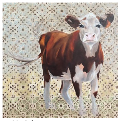
Work by Cathy Love

The event is FREE and open to the public and will also feature live music featuring