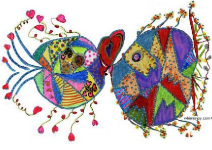
"Bursting with Love"