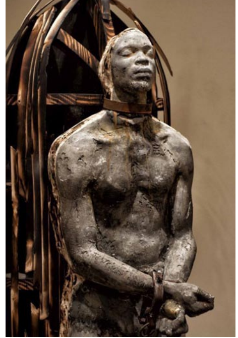
Work by Stephen Hayes

For further information check our NC Institutional Gallery listings, call the Museum at 919/839-6262 or visit (www. ncartmuseum.org).