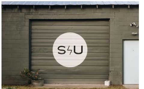
A view of the Studio Union in North Charleston

Studio Union is a professional art space