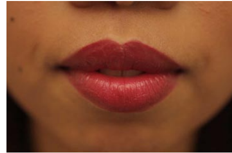
Endia Beal, "Office Scene", 2012. Color video with sound, 3 min. 30 sec.

"In order to serve the people, art must reflect the social reality of the times."