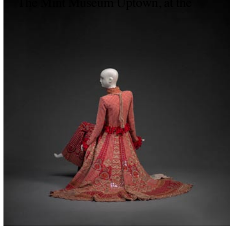
Anamika Khanna (Indian 1971-). "Coat, Pants, Necklace", Fall 2019, silk, cotton, metalic thread, beads. Museum Purchase: Funds provided by Deidre Grubb 2021 19a-c

a rare example of Kohlmeyer in her artistic adolescence. Geometry with Feeling will exhibit Transitive alongside more mature examples from the artist's painting and sculptural practices to encourage audiences to think critically about the evolution of the artist's recurring motifs and the refinement of her increasingly postmodern abstraction. For further information call the Museum at 828/295-9099 or visit (www.blowingrockmuseum.org).