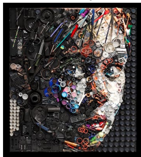
Work by Kirkland Smith

founding in 1972 by the Mint Museum Auxiliary, Fashion Reimagined features 50 outstanding examples of fashionable dress drawn entirely from the permanent collection of The Mint Museum. Encompassing a wide range of attire, the exhibition includes men's and women's fashions from 1760 to 2022 and is divided into three thematic sections: minimalism, pattern and decoration, and the body reimagined. For further information call the Museum at 704/337-2000 or visit (www.mintmuseum.org).