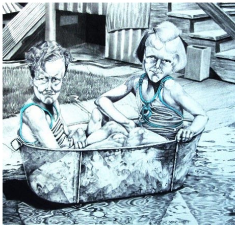
Work by Steve Opet

Cape Fear Studios, Inc., 148-1 Maxwell Street, Fayetteville. Through Feb. 21 - "Annual Cabin Fever Exhibit". This show is open to all artists 18 and older and features art in all mediums: oil, acrylic, and watercolor paintings; hand-crafted wood art; hand-crafted jewelry, fiber and decoupage, photography, pottery, glass artworks, and drawings in mixed medium. Ongoing - New Gallery exhibit every 4th Friday of the month. We are a nonprofit cooperative of 30 local artist (always looking for new members) creating 2D & 3D art. Our Gallery displays exhibits of visiting artist's work as well as our own exhibits with individual studios where member artists create fantastic works of art onsite. The Gallery show is free of charge and the public is welcome to watch the artists at work. Group and individual classes in a variety of media are ongoing. Reg. Hours: Mon.-Fri., 11am-5pm & Sat., 10am-4pm. Contact: 910/433-2986, e-mail to (capefearstudios@ capefearstudios.com) or at (www.capefearstudios.com).