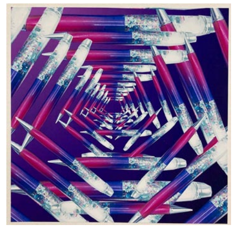
Work by Joselyn Moreno, Bluffton High School

Bluffton High School's art program includes ceramics, drawing, media arts, painting and photography. The students