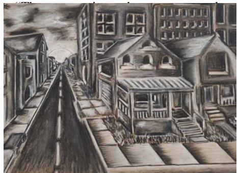
Work by Danyela Fusi, Cross School

John Cullinen, Arts Teacher at Cross Upper School, said Cross School has a growing art program that infuses traditional mediums with digital art and photography - a sampling of which will be shown in SOBA's upcoming show.