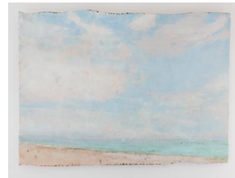
Work by Erin Hughes

In Fragments Hughes employs a variety of mediums including encaustic, graphite, pan pastels, and oils. With each layer of medium, a landscape evolves... a reminder