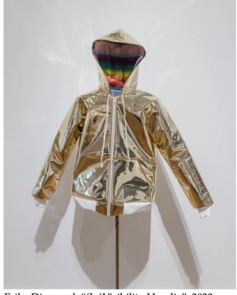
Erika Diamond, "(In)Visibility Hoodie", 2022, reflective vinyl fabric, zipper, "Ombre Rainbow Pride Celebration Cotton Fabric" from JoAnn®, life-sized

The sun still rises in spite of it all draws inspiration from the Van Every/Smith Galleries' 2014 exhibition State of Emergency in its consideration of the role of visual artists in documenting, illuminating, and rendering disasters. In the catalogue for that exhibition, Marita Sturken opened her essay by noting that "the condition of disaster is often defined as a state outside of the norm." The premise for this exhibition reconsiders Sturken's statement. In the wake of a global pandemic, wars, increased mass shootings, widespread climate-driven catastrophes, a