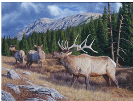
Work by Cody Oldham

Since the inaugural SEWE was held in February 1983, we have become an important and highly-anticipated event in Charleston, kicking off the city's tourism season and becoming synonymous with Presidents' Day weekend celebrations. The original show hosted 100 artist and exhibitors and 5,000 attendees. Now SEWE welcomes approximately 500 artists, exhibitors