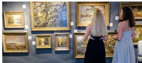
Two Women view art at the Expo

the place where artists, exhibitors and sporting enthusiasts gather in Charleston - from all corners of the nation - united by a shared love for wildlife, conservation and the great outdoors. Each year, we receive hundreds of applications from artists and exhibitors, eager to join the SEWE community. It's one of our greatest pleasures to welcome new talent to the Lowcountry every February. As we prepare for another remarkable SEWE, we invite you to explore 2024's new artists and exhibitors collective. Learn about these passionate contributors, discover their origins and preview what they'll showcase