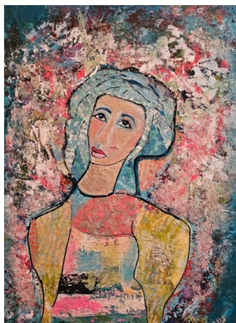
Work by Ruthie Beberman Sumpter

Sumpter states, "My art is intuitive and not from schooling, and my priority is color and shape. The base layer after gesso is a texture medium. In some pieces, I may add figures or faces and I rarely know before hand how the final painting will come together. The high degree of unpredictability fascinates me. My painting is not complete until my colors and shapes form a unifying whole. When it is pleasing to my eye, my