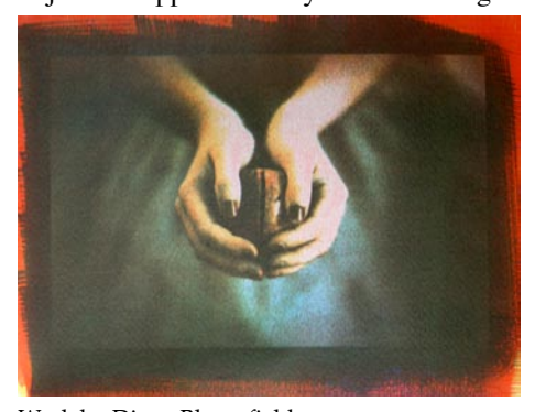
Work by Diana Bloomfield

Bloomfield has also created an extensive series featuring her daughter as model and muse. Images created with a pinhole camera are often the result of long exposure times leading to a soft focus and somewhat myopic perspective. Figures become almost ghostly while fast moving objects disappear entirely from the image.