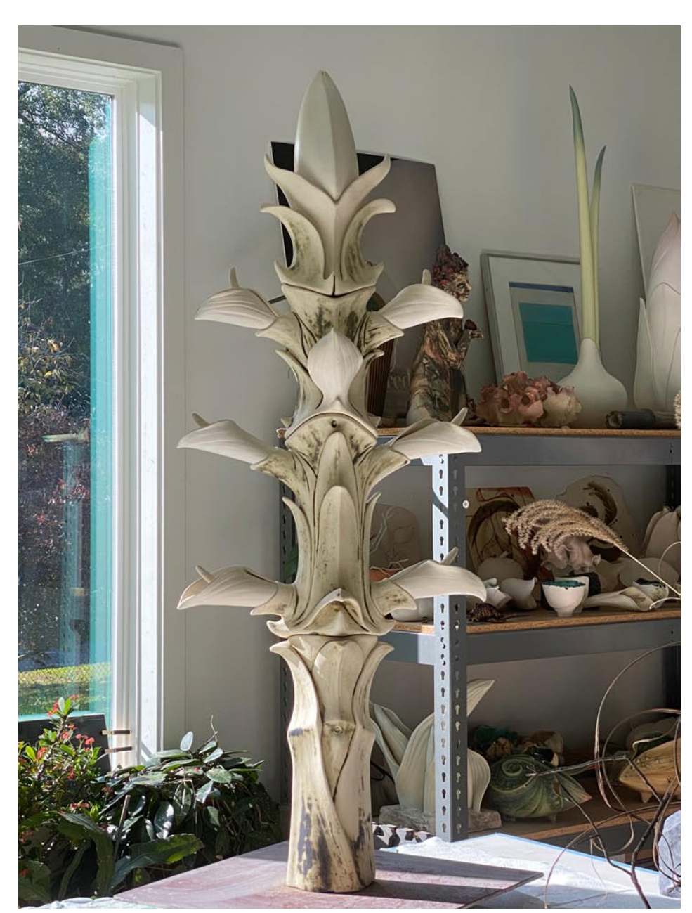
"This one is a commission going to Hawaii at the end of the show for a garden. It's title is Totem X. It will be about 5 feet tall with its steel base plus a transition base below the Totem. It is made of stoneware and porcelain with copper and some terra sigillata. It will be in the show courtesy of Fia and Phillip Richmond." - Alice Ballard