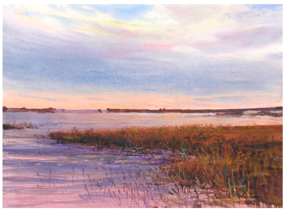
Thomas McNickle, Kiawah Evening Study I, 2009, Watercolor and Prisma pencil on paper, 10 x 14 inches