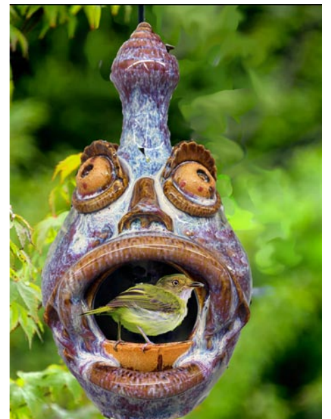
Work by Walter Aberson

Village Pottery Marketplace is on East Main Street, in downtown Seagrove, NC 27341.