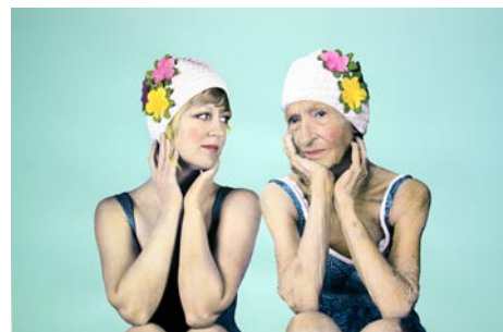
Jenny Fine, "When We Were Synchronized Swimmers", hand-colored archival pigment print, 2010/2021, 40" x 60"

Synchronized Swimmers is a multimedia, photographic stage that juxtaposes the still against the moving, 2D with 3D, in an attempt to create a phantasmagoric stage for a highly costumed, multimedia performance to unfold. Relying on research and imagery from the Gulf Coast of Florida, including the Weeki Wachee Springs Mermaid Show, Synchronized Swimmers will source untrained performers from the hosting communities to embody the photographic space. Fog, animated lighting, and sound lure the viewer deeper inside the story towards a willing suspension of