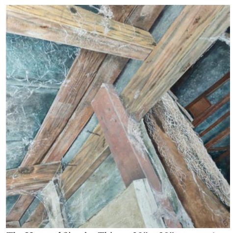
The Heart of Simpler Things, 30" x 30" encaustic on board

Fontaine is a visual artist, with a studio at the Greenville Center for Creative Arts, Greenville, SC.