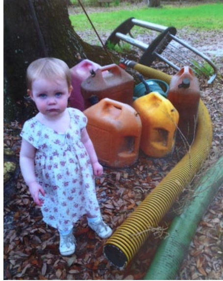
The Importance of Granddaughters, 10" x 8" color print and encaustic on board

There was a time, after the death of my Grandparents on my Mother's side who ran a dairy farm business in central Michigan, when I returned to that farm, abandoned and now owned by the neighboring farm to relive memories of time spent on that farm and take photographs. My first impression was of how small the farm seemed when it was once a spralling land of adventure. I explored rooms that