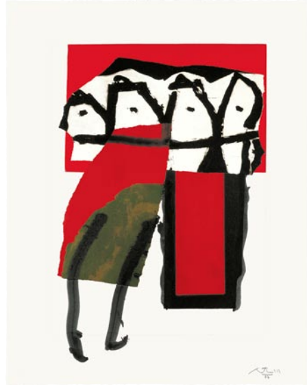
Work by Robert Motherwell

Robert Motherwell (1915-1991) was the youngest member of the heroic generation of post-war Abstract Expressionists who revolutionized painting and shifted the art world's attention from Paris to New York. He is also the only one of the group (which included Jackson Pollock, Hans Hoffman, and Willem DeKooning) for whom printmaking became a major preoccupation. Motherwell's work as a printmaker, as well as a painter, distinguished him, both for his innovations in graphic media and for his stunning images on canvas and paper.