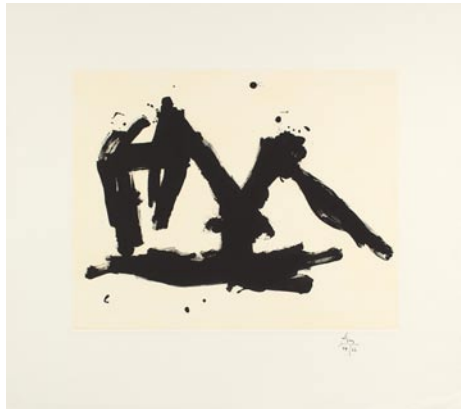
Work by Robert Motherwell

For further information check our NC Commercial Gallery listings, call the gallery at 704/365-3000 or visit ( www.jeraldmelberg.com ).