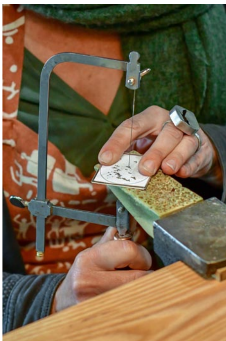
Audrey Laine - jewelry

For a complete list of artists participating in Glass & Metal Day, visit our Facebook Events page, visit (craftguild.org/events) or call 828/298-7928. Participants