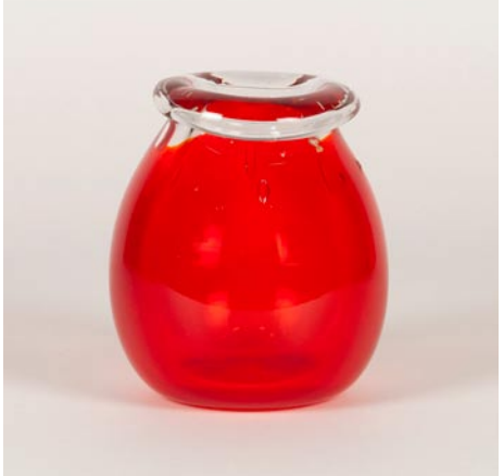
Harvey K. Littleton, "Amber Maze", 1968, blown glass, 8\,3/4\times10\,1/2\times6 inches. Asheville Art Museum. © Estate of Harvey K. Littleton.

A Hand in Studio Craft: Harvey K. Littleton as Peer and Pioneer highlights recent gifts to the Asheville Art Museum's Collection and loans from the family of glass artist Harvey K. Littleton. This exhibition places Harvey and Bess Littleton's collection into the context of their lives,