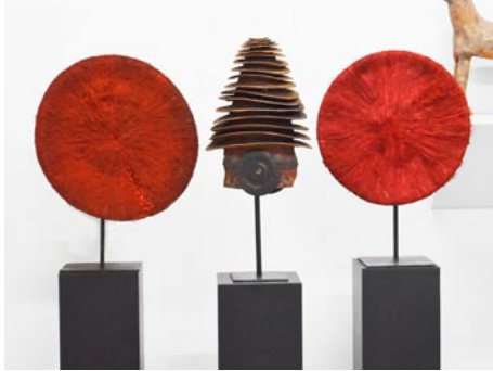
Pictured are two Zulu hats worn by married women in South Africa and an Ekonda hat with a tiered crown and copper emblem from the Congo.

Bottega Art & Wine Gallery, 208 N. Front St., Wilmington. Ongoing - Featuring works by regional and international artists in a variety of media. Hours: Tue.-Wed., 1-10pm and Thur-Sat., 1pm-midnight. Contact: 910/763-3737 or at (www.bottegagallery.com).