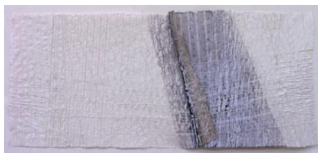
Signe Stuart, "Glacier 1", 2017

NC Institutional Gallery listings, call the Center at 828/262-3017 or visit ( www.turchincenter.org ).