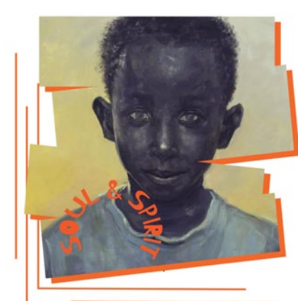
Work by Tyrone Geter

The Arts Council of Fayetteville | Cumberland County is a tax-exempt 501(c) (3) organization based in Fayetteville, NC that supports individual creativity, cultural preservation, economic development, and