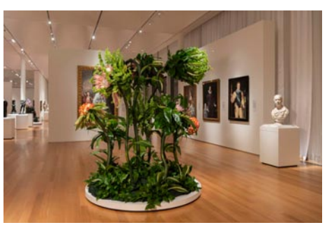
View from a previous "Art in Bloom" event

Tickets for members and nonmembers are on sale now. Ticket pricing is as follows: • $30 Members • $33 Nonmembers • Free for children 6 and under Tickets are available at (ncartmuseum.org/bloom) or