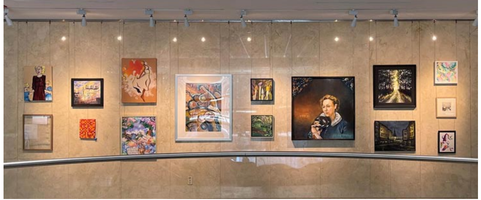
View of the "16th City of Raleigh Employee Exhibition".

The City of Raleigh in Raleigh, NC, is presenting the 16th City of Raleigh Employ- ee Exhibition , part of the National Arts Program, on view in the Block Gallery (inside Raleigh Municipal Building), through May 19, 2023. A reception and awards ceremony will be held on Mar. 30, from 5:30-7:30pm.